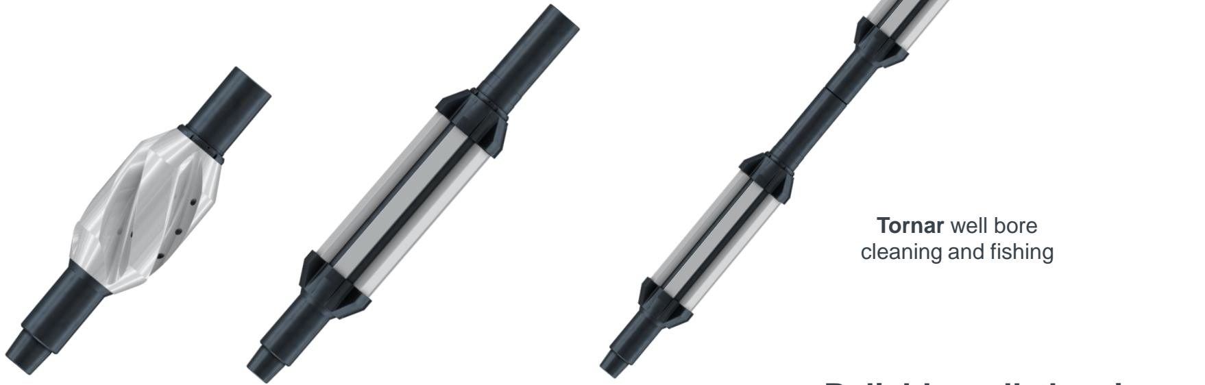
Tornar well bore cleaning and fishing