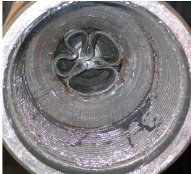
Dart placed in 2.8" ID