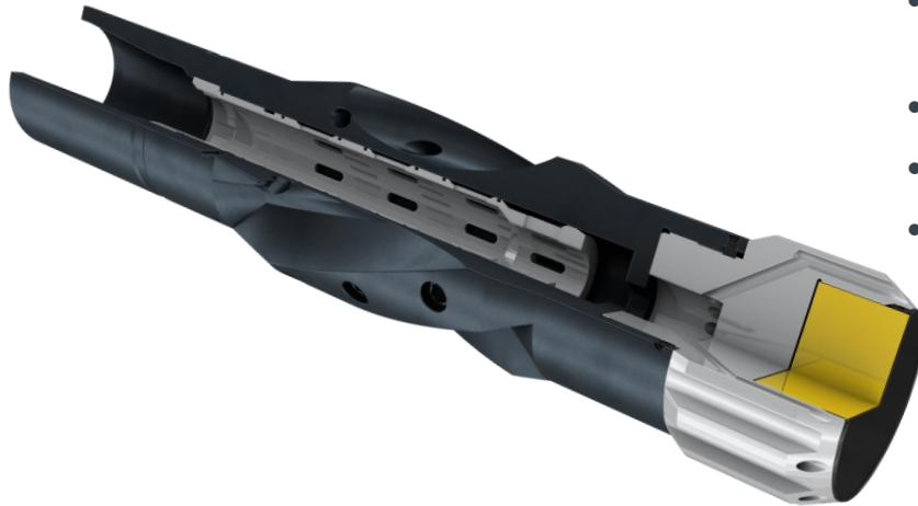
Tornar well bore cleaning and fishing