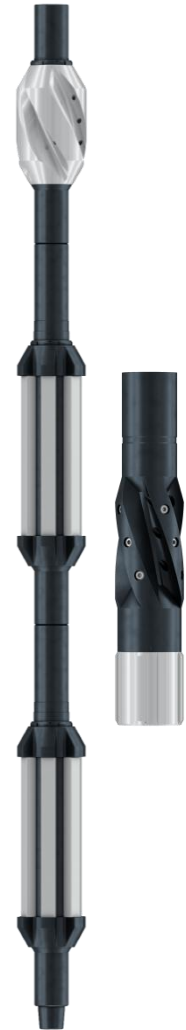
Tornar well bore cleaning and fishing