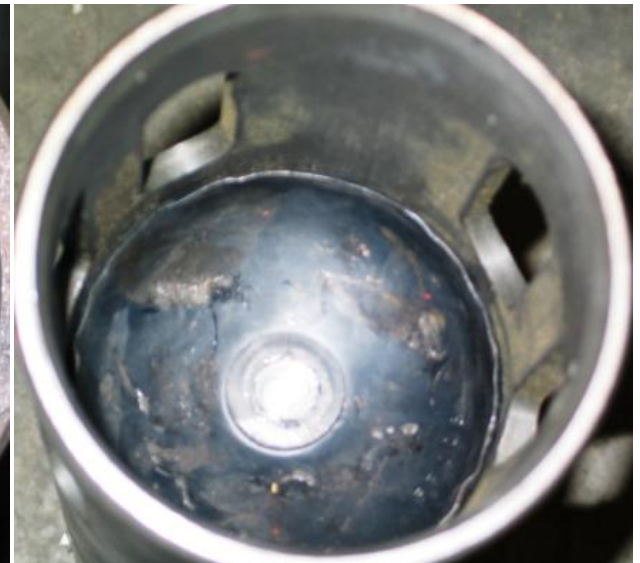
Dart placed in 4" ID